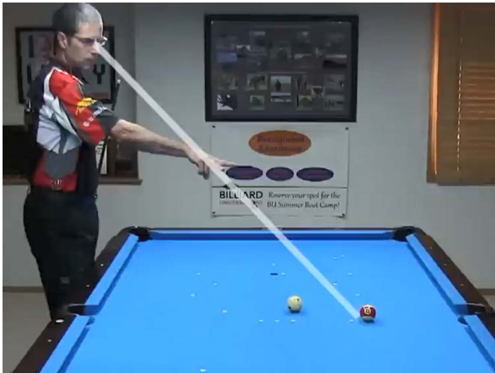
Image 2 Air peace sign

Recently, I developed an improvement to the air peace sign technique. Again, start by visualizing your first finger projected down to the ghost ball (see Image 3 ). As shown in the video, if you are focusing at the OB, as you should, you will see two different images of your finger at the ball since each eye sees a different picture. You want to position your hand so each image of the finger is on either side of the ideal position. The shot example in Image 3 is a half-ball hit, so the ideal position is with the finger over the edge of the OB.