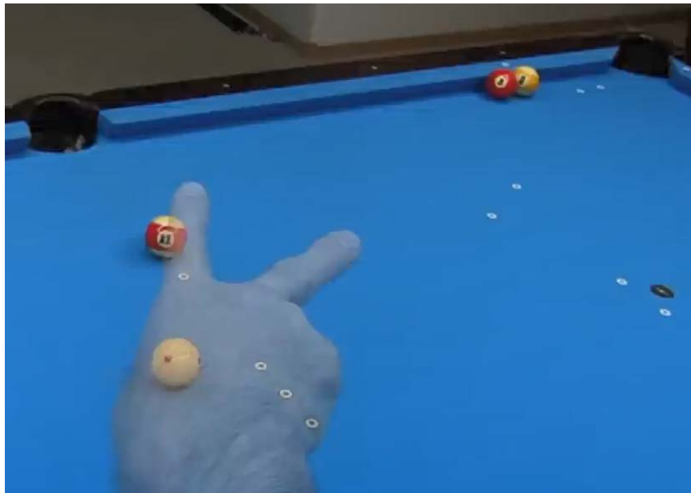
Image 3 Air peace sign example

Recently, I developed an improvement to the air peace sign technique. Again, start by visualizing your first finger projected down to the ghost ball (see Image 3 ). As shown in the video, if you are focusing at the OB, as you should, you will see two different images of your finger at the ball since each eye sees a different picture. You want to position your hand so each image of the finger is on either side of the ideal position. The shot example in Image 3 is a half-ball hit, so the ideal position is with the finger over the edge of the OB.