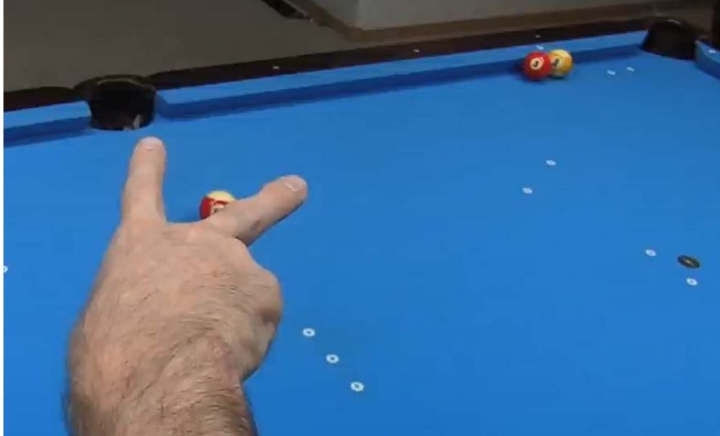
Image 4 Air peace sign after parallel shift

In past videos and articles, I said to just imagine your second finger direction being parallel-shifted down to the ghost ball to visualize the direction the CB will head. The new technique, which is easier and more accurate, is to just parallel shift your hand without moving your head so you are now looking through the second finger projected down to the OB (see Image 4 ). This will allow you to more accurately visualize the CB carom direction after the hit. In this example from a game of 8-ball playing stripes, after pocketing the 11, the CB will carom into the 3 to also pocket the 9.