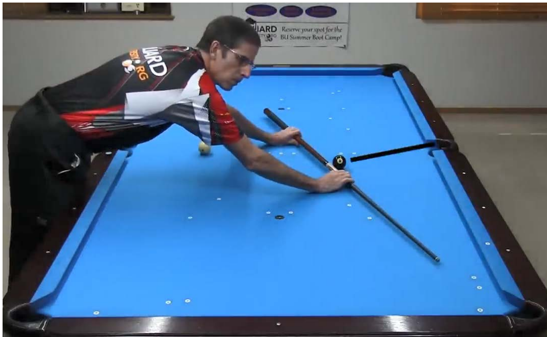
Image 3 Using the Cue to Visualize the Tangent Line

You can also use your cue to visualize the tangent line of a shot. Image 3 shows the most common way when you can easily reach the OB. Just position the cue perpendicular to the line to the pocket. Here, I am pointing the joint of the cue to the pocket, and the tip points to where a stun shot would head, in this case to the corner pocket. As demonstrated in the video, you can easily avoid the scratch here with a follow or draw shot.