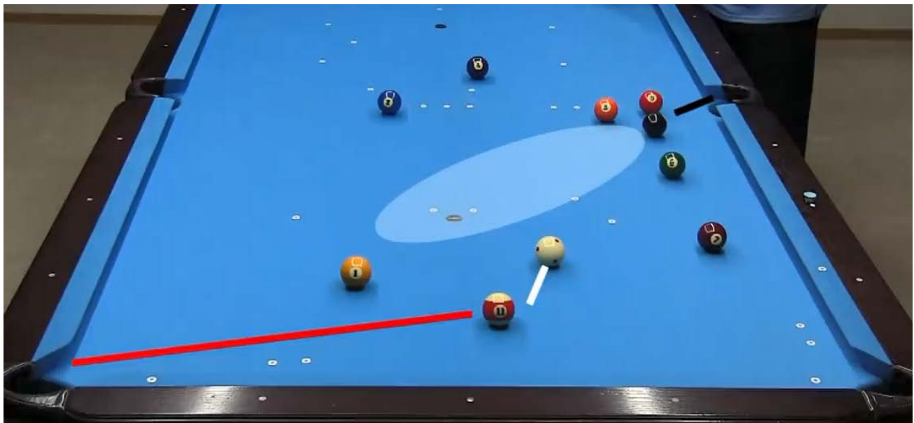
Image 1 Low-Inside Kill Shot