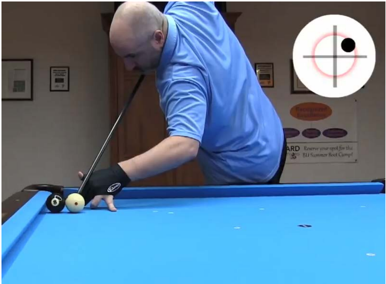
Image 5 Frozen Rail Safety