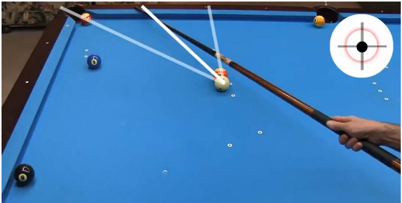
Image 4 Twice-As-Full System