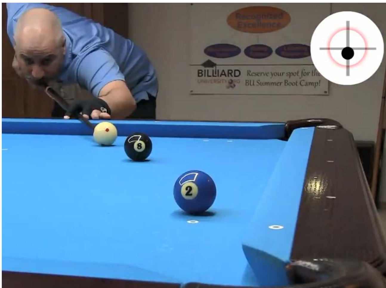
Image 3 Thick Hit Rolling Ticky